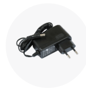
24 V 0.38 A power adapter