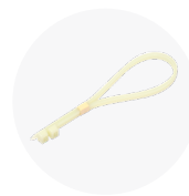
2x plastic straps