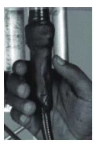
Figure 2-3 Wrapping Waterproof Clay

c). Wrap the waterproof tape again, as shown in Figure 2-2.