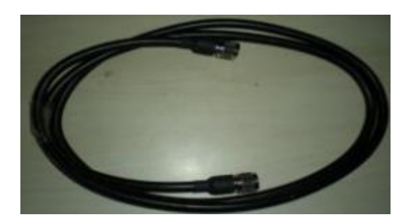
Figure 1-3 Standard Waterproofing Material for the RG-ANTx3-5800D