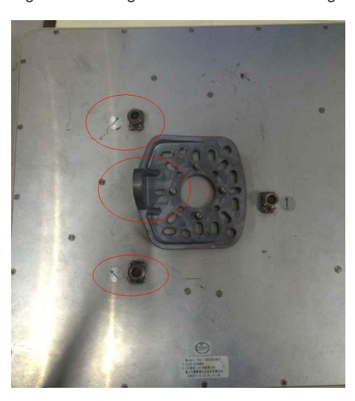
Figure 2-1 Fixing the Antenna and Mounting Bracket